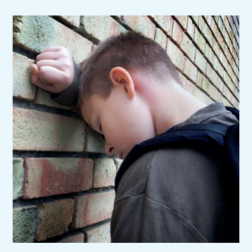
Welfare for children, youth and families