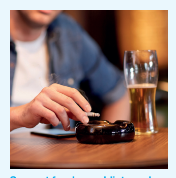
Support for drug addicts and those at risk