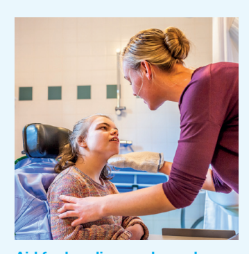
Aid for handicapped people